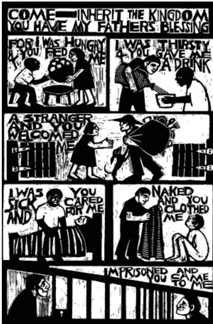
The Corporal Works of Mercy by Eda Bethune